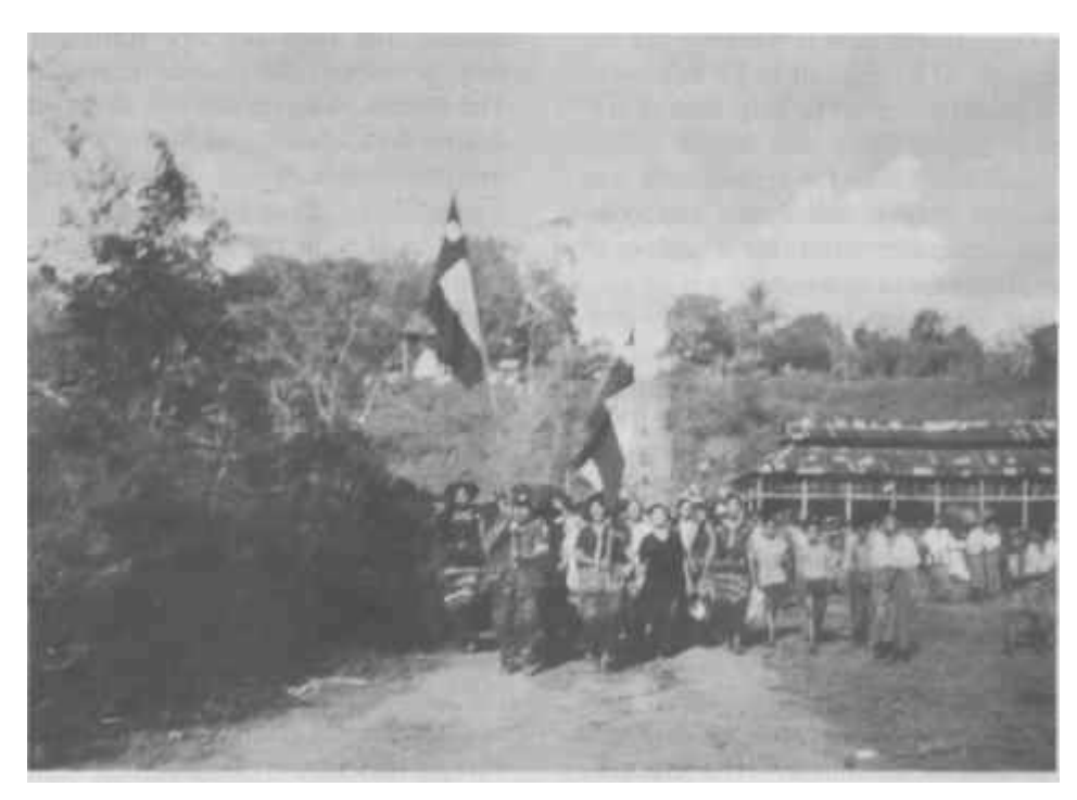
Central KWO leaders at Mina An.

'They asked the Navy why there were so many boats that appeared to be smugglers boats. The Navy was a bit embarrassed about that and told the Air Force to give them four or five days warning when they were flying over the sea in their areas because they had noticed some unidentified aircraft and didn't want to shoot down their own by mistake.'