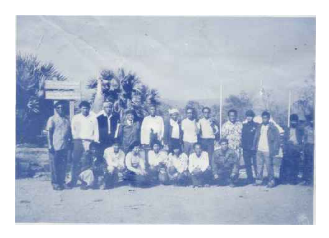
NDF leaders on Mon National Day at Payathonzu.