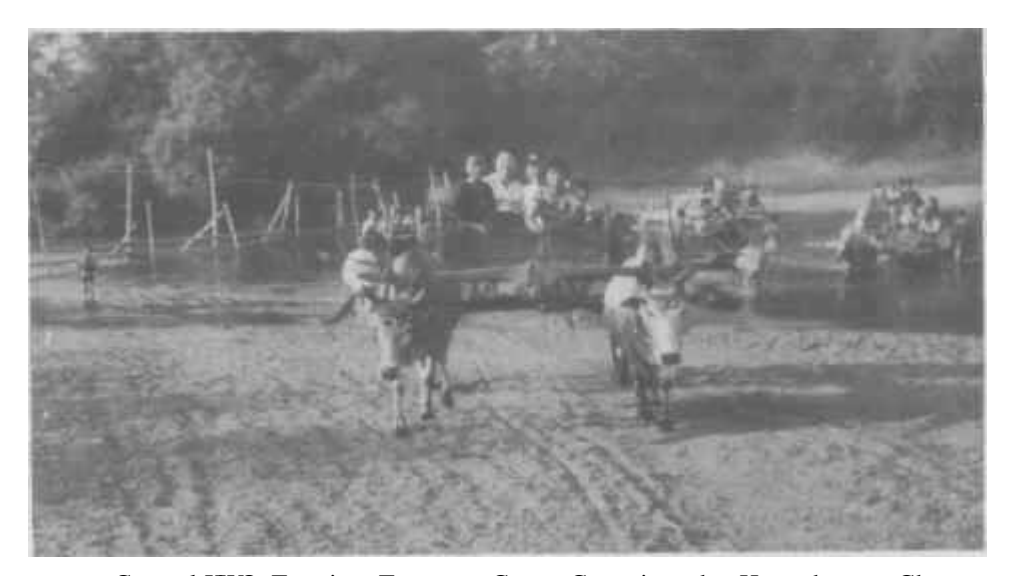
Central KWO Touring Team on Carts Crossing the Hongtharaw Chaung.