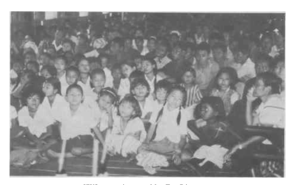
KWO meeting at Me Ta Rit.

In conclusion, the NDF, based on 12 years of past experience has become more mature and stronger. It stands solidly behind all the oppressed citizens of Burma who have endured 40 years of the vagries of a civil war, and in order to achieve the goal of peace and federal union in consonent with the wishes of the people, will steadfastly continue the fight for freedom and dignity.