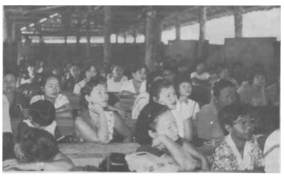
KWO meeting at Thay Baw Bo market.