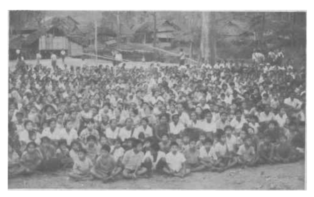
Sho Klo KWO meeting.