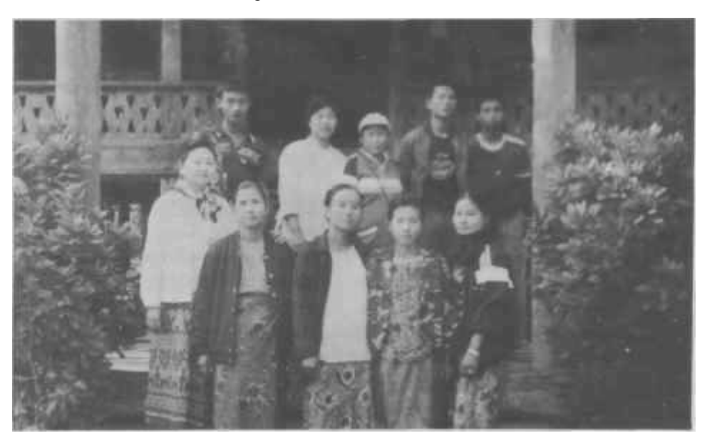
Central KWO touring team at Mina An monastry.