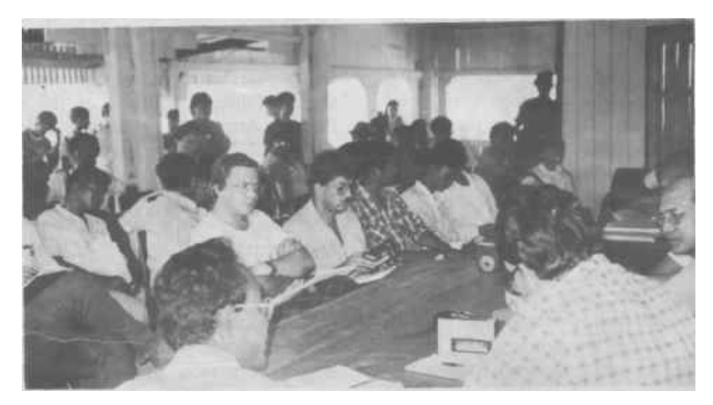
Journalists with NDF leaders at Mon National Day celebration.

Central Standing Committee KNU-Karen National Union