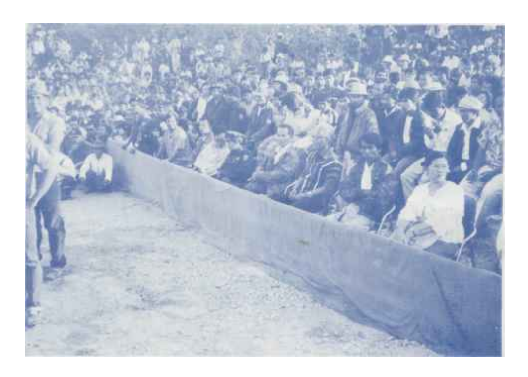
NDF leaders (Right Front) at Mon National Day celebration.