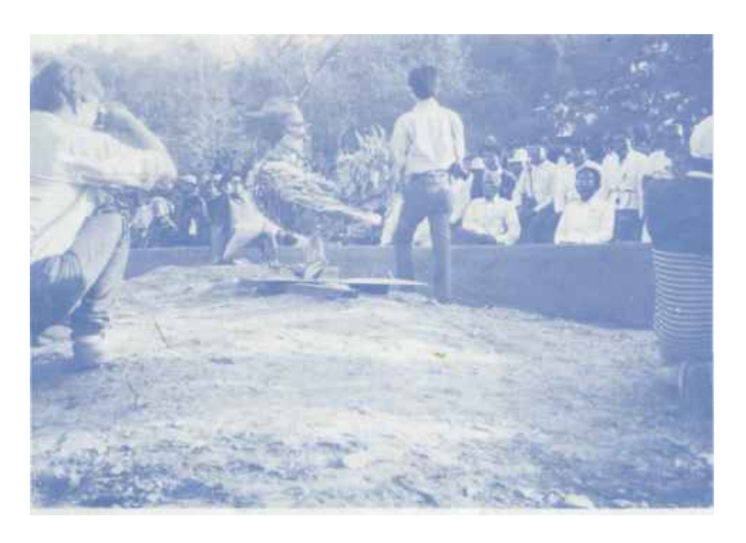
The Golden Hintha Seen at Mon National Day.