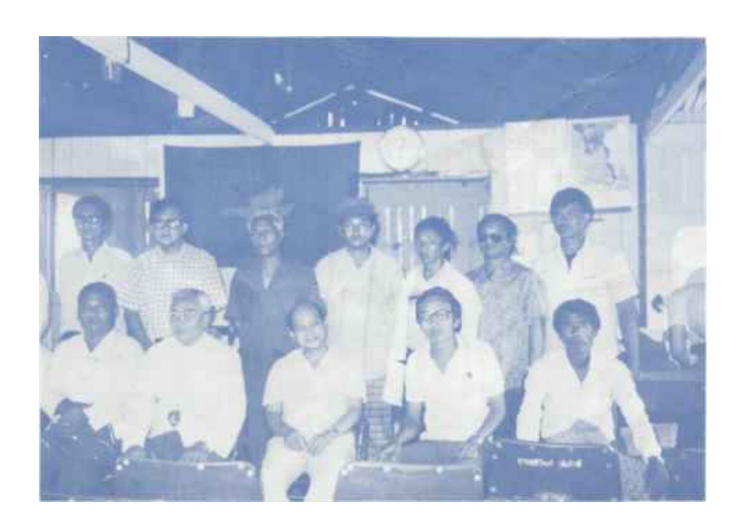
NDF leaders attending Mon National Day celebration.