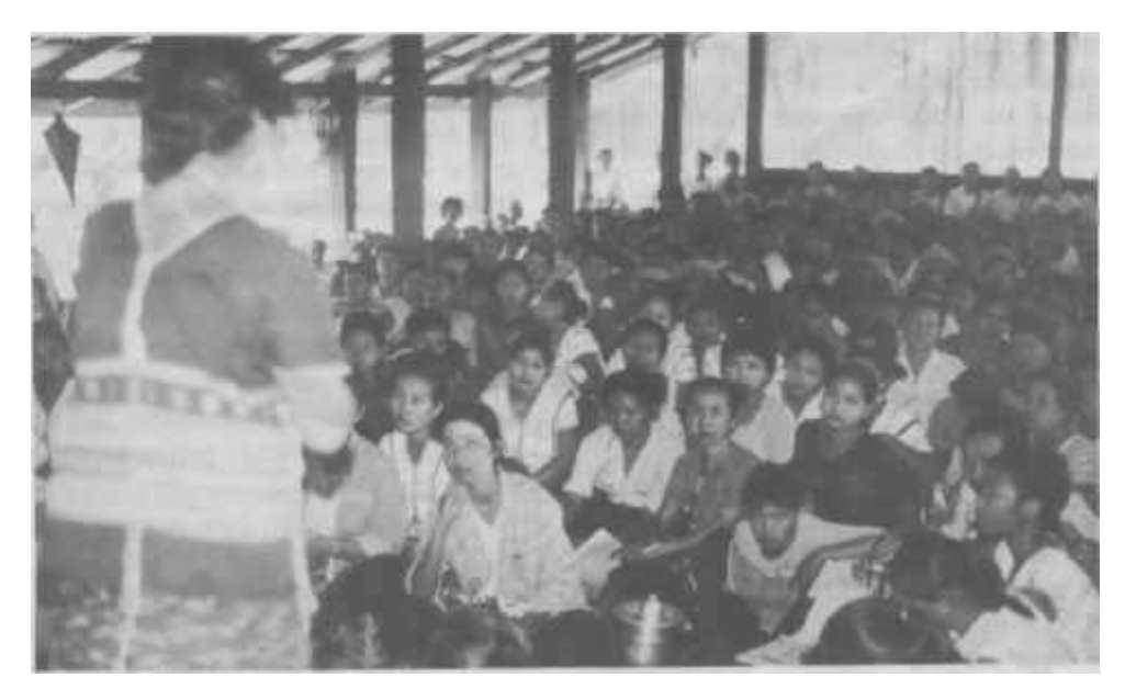
Kawthoolei Women's Orgzt. meeting at Azin. Dooplaya Dist.HQ.